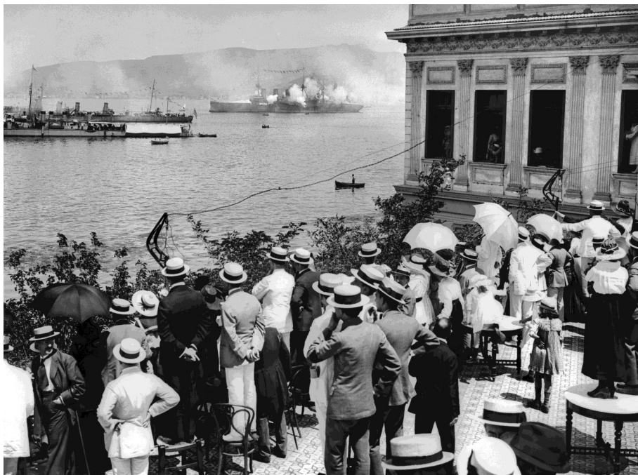
The Sporting Club, May 1919