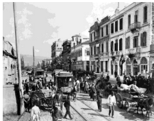
The Quay of Smyrna Early 20 th Century

Vasilopitta organised by the Ionian Society. A party to welcome the New Year with buffet dinner, wine and refreshments. Ticket £15. Further information and bookings on 07808 777946 or at anastasia.savidu@hotmail.co.uk .